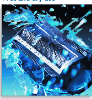
100% waterproof appliance makes it convenient to trim and shave your body in the shower and easy to