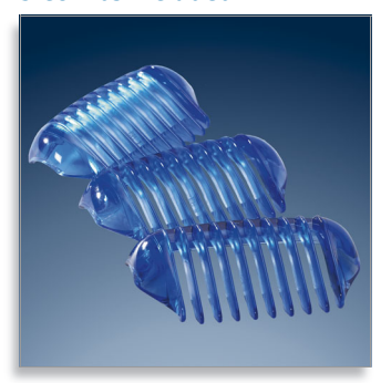
3 combs provide different fixed length settings of 3, 5 and 7 mm for safe and easy trimming of all body