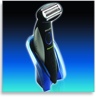
Charging stand provides convenient storage and ensures the appliance is fully charged and ready to