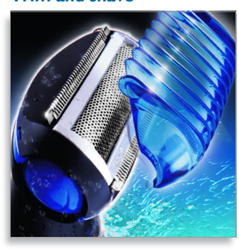
This bodygroom can both trim and shave all body