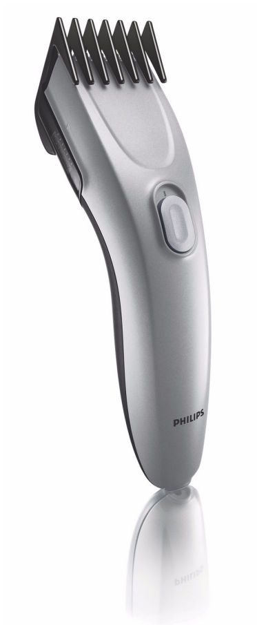
Philips Hair clipper